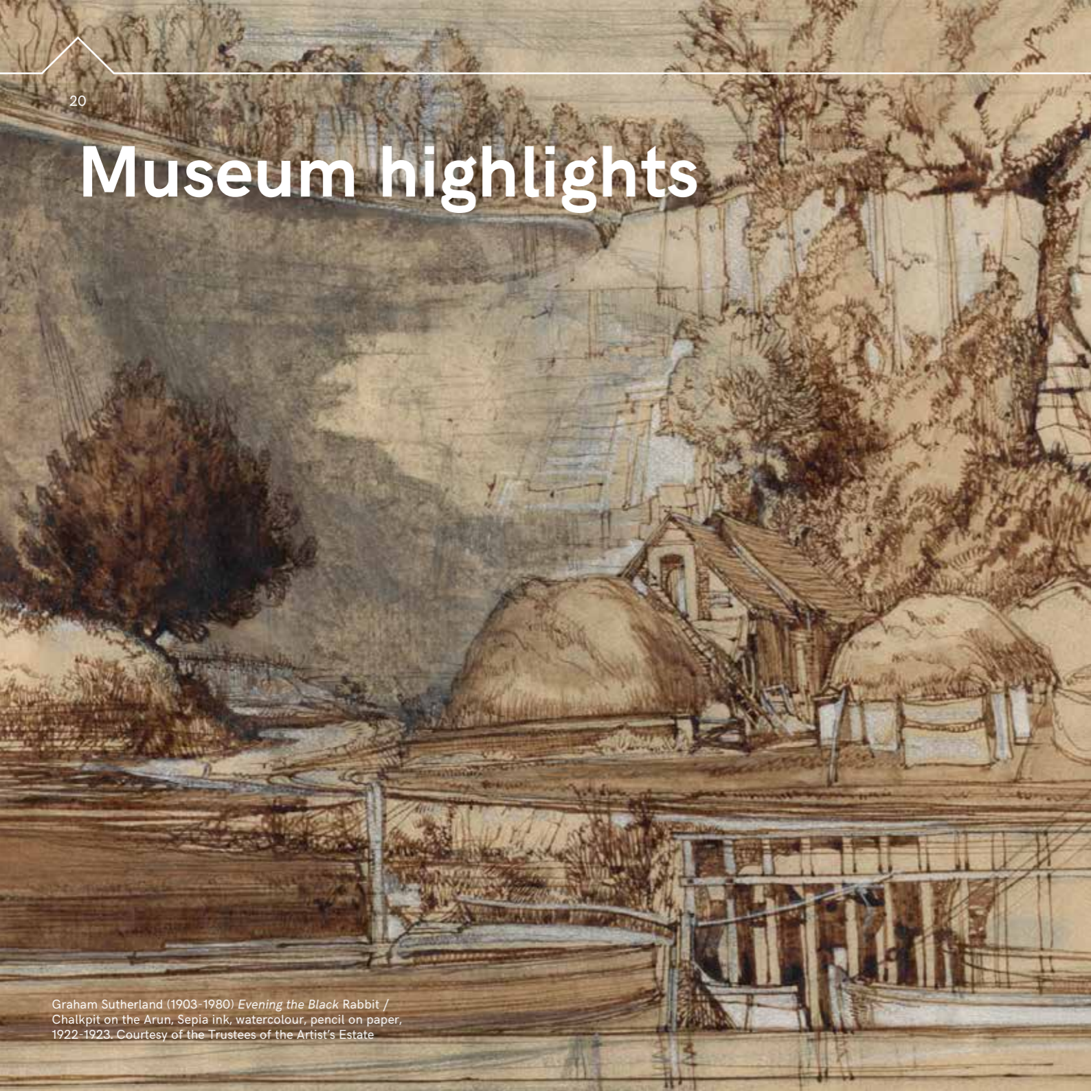
Graham Sutherland (1903-1980) Evening the Black Rabbit / Chalkpit on the Arun, Sepia ink, watercolour, pencil on paper, 1922-1923.